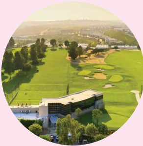
Elite Club Fitting Experience at Titleist Performance Institute