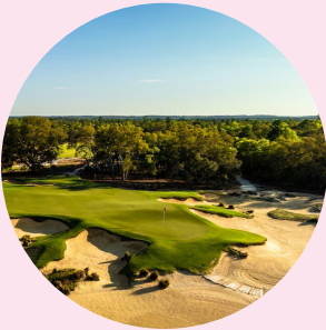
Ultimate Golf Getaway at Ochopee Match Club