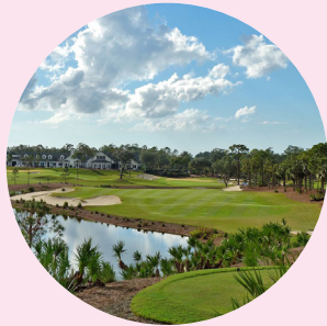
Exclusive Stay & Play Experience at Calusa Pines Golf Club